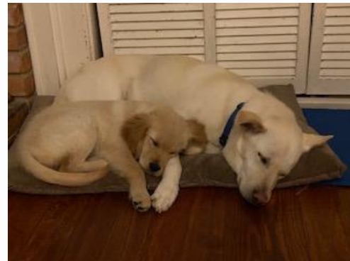
Sol 20-015 Sol, now Phoebe, was adopted on April 10th. How stinkin' adorable is she?!!!