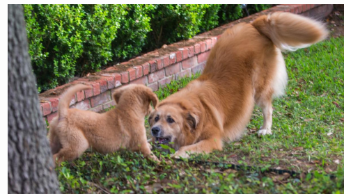
Luna knows two speeds - full throttle and exhaustion. She likes to run around the backyard and play with her big sister Sasha. Luna loves being with her people and welcomes gentle touch and hugs.