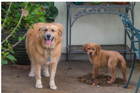
Luna, 20-014 Luna, now known as Lucy, was officially adopted on April 13th. Luna is very sweet and loves cuddling. She loves running and jumping and occasionally, digging, which her new parents don't enjoy much. She gets into everything and is SO curious about the world around her.