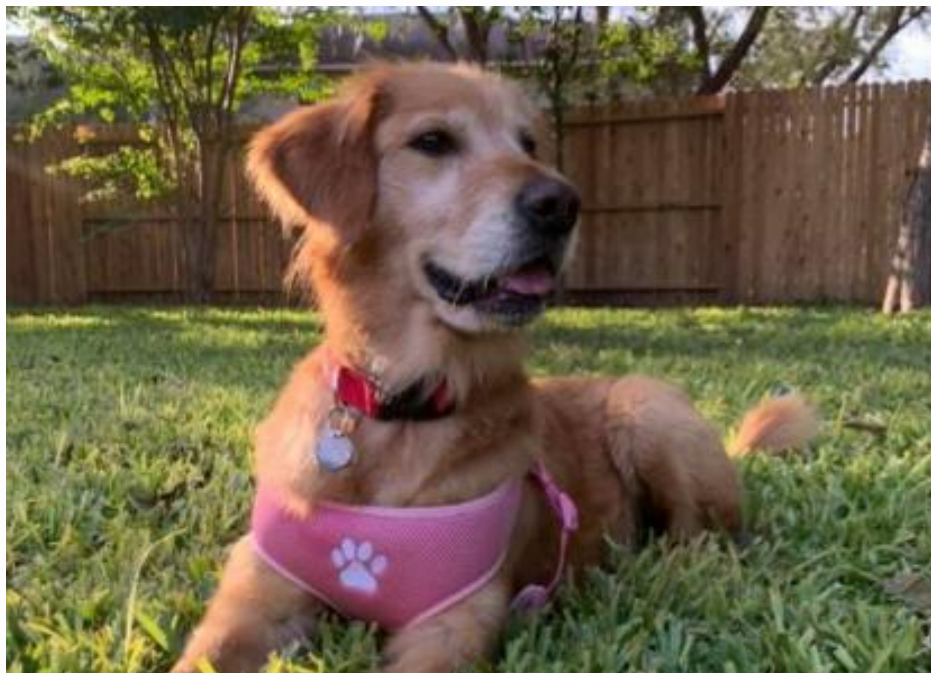
Cedar 19-103 Cedar was adopted on April 7th. Her new family loves her and feels that she's at her best now!