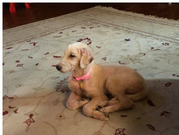
Dreidl 19-116 in her foster home