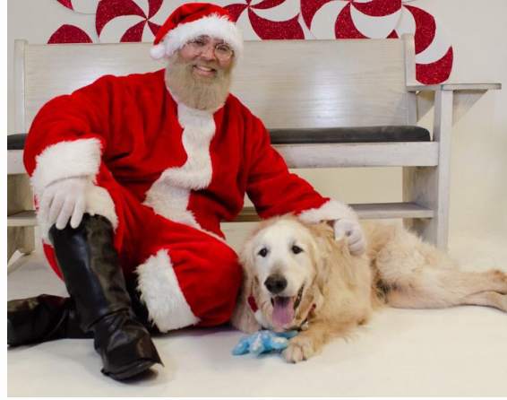
The Colonel visiting Santa this Christmas. He's been a very good boy!