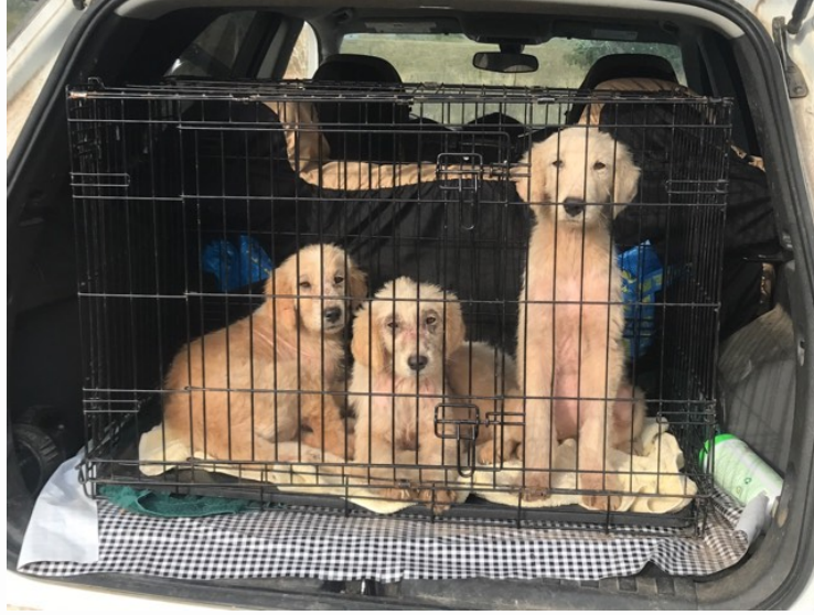
The Hanukkah Girls Freedom Ride