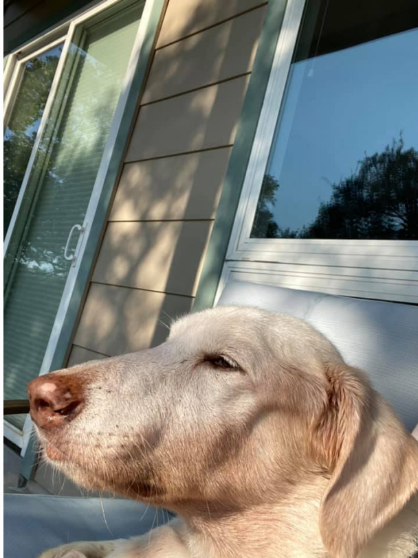
Salsa (20-056) at the lake.

That was almost 3 months ago. Sadly, yellow Lab Salsa (20-056) , the only girl, passed away a few weeks after rescue. The effects of prolonged starvation and untreated dental disease had left her 30 pounds underweight, in renal failure, and simply too far gone for us to save. But she spent her last days clean, cared for, loved, and sunning herself at the lake. It's heartbreaking, but sometimes, providing end-of-life care is the best that we can do.