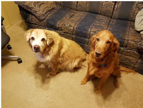
Sherman (left) with Kyna