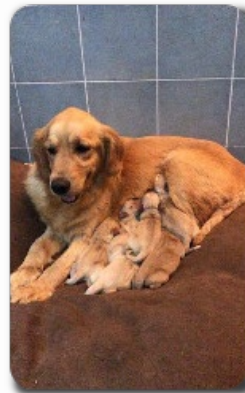
Name: Peony Symbolizes Riches Age: 14 months Gender: Female Sponsored by Amy McCaffrey