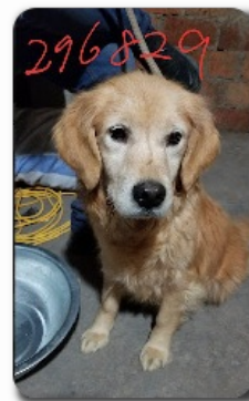
Name: Mei-me Meaning: Little Sister Age: 2 years Gender: Female Sponsorships Needed