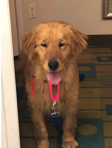
China Golden Zera