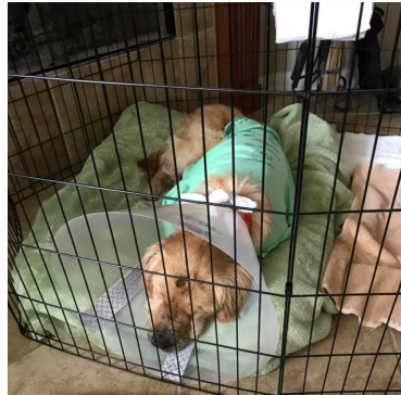
China Golden Phoenix