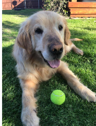
China Golden Shenshi