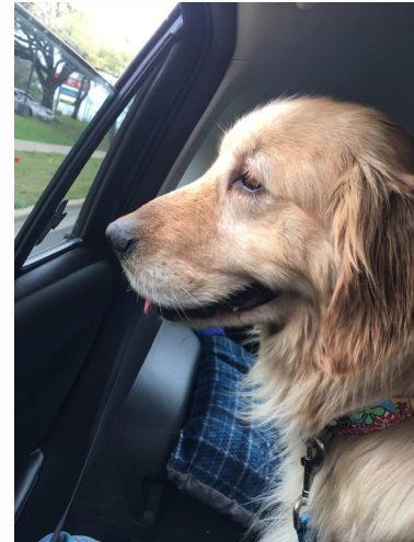
China Golden XiXi