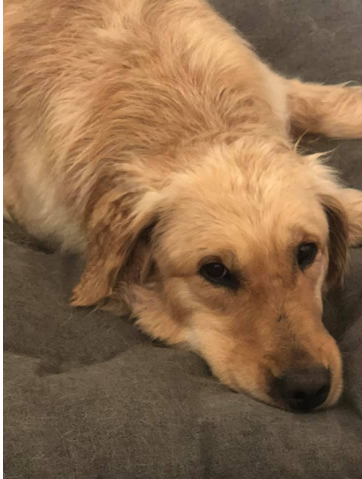
China Golden Promise