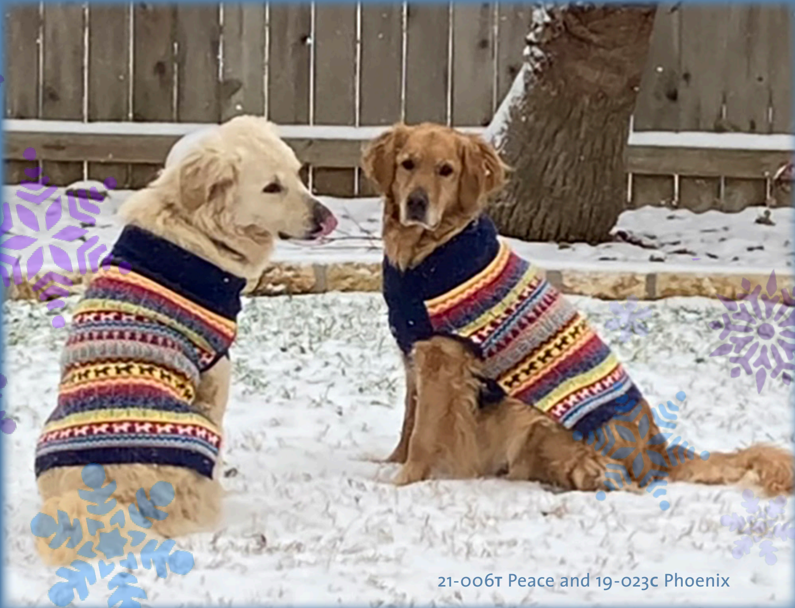
21-006T Peace and 19-023C Phoenix