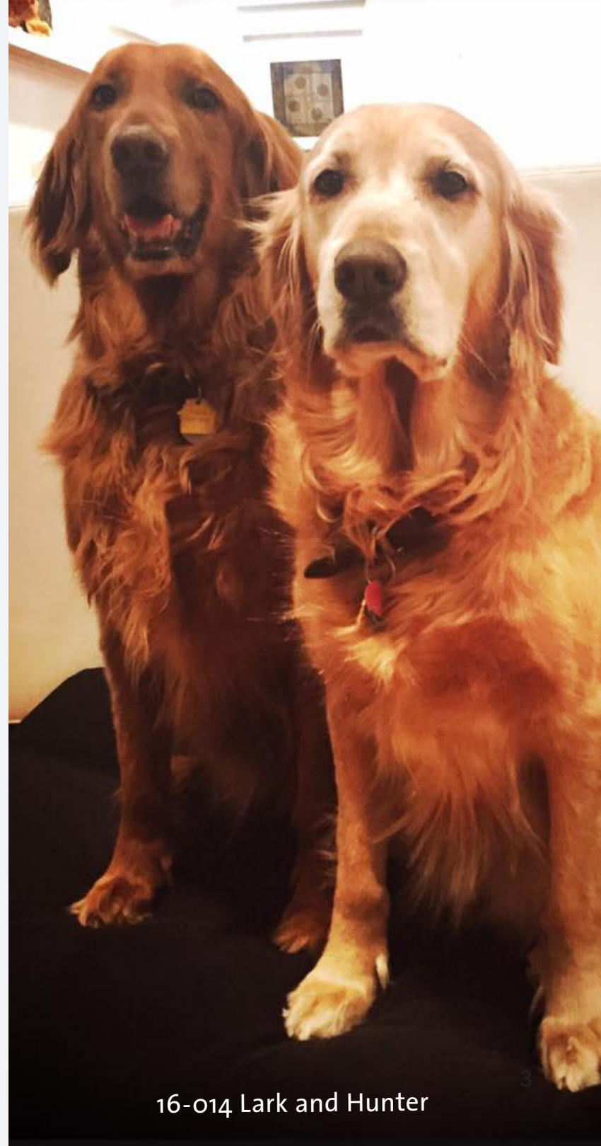
16-014 Lark and Hunter

All potential adopters complete an application, telephone interview and in-person home visit. This helps us ensure that each dog is placed with the right family to receive the individual attention, medical care and training that they need lifelong. We also have a Permanent Foster program that provides lifetime care for Goldens that cannot be adopted because of age or medical/behavior situations.