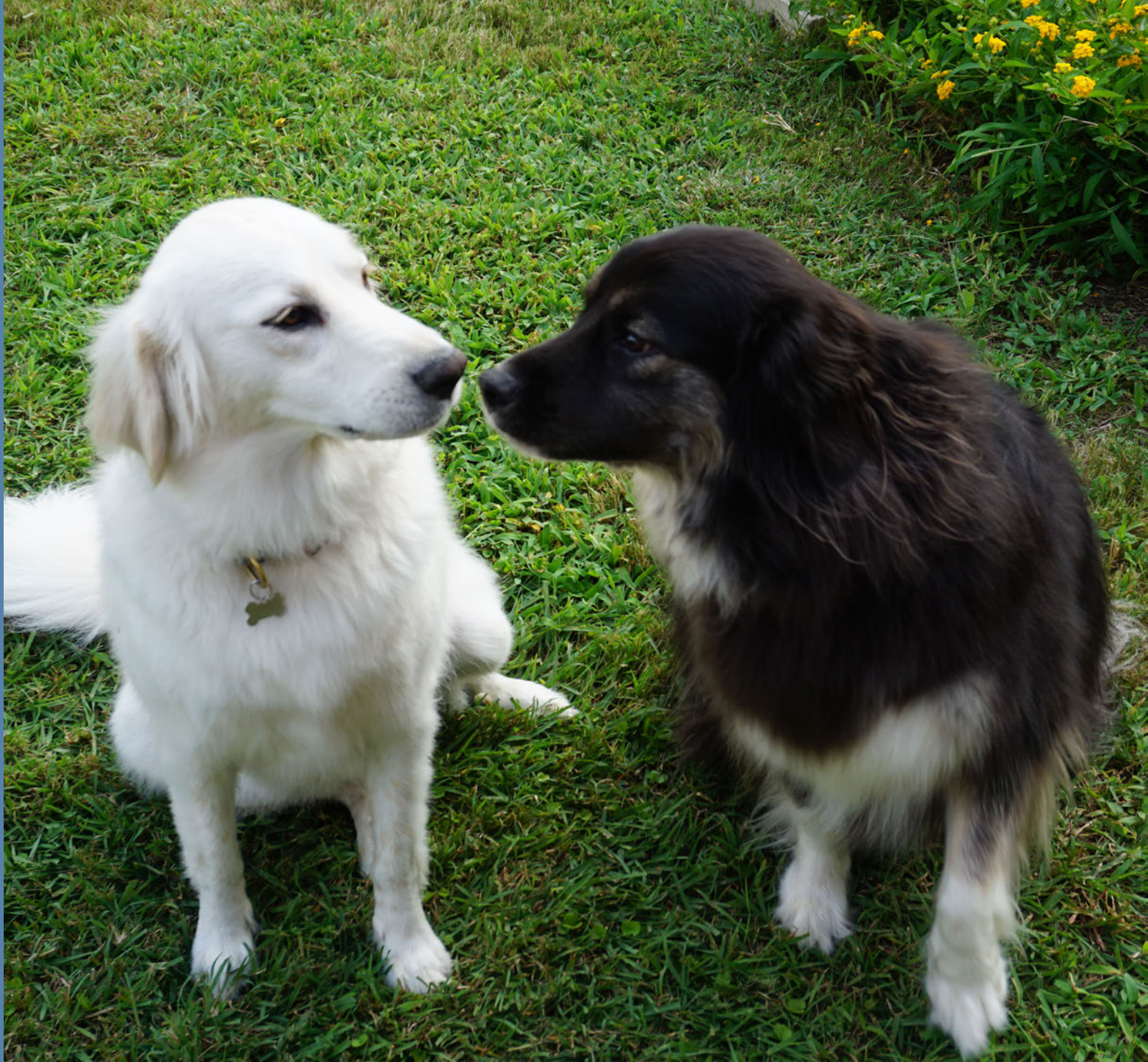
19-053 Daisy and 19-052 Glory