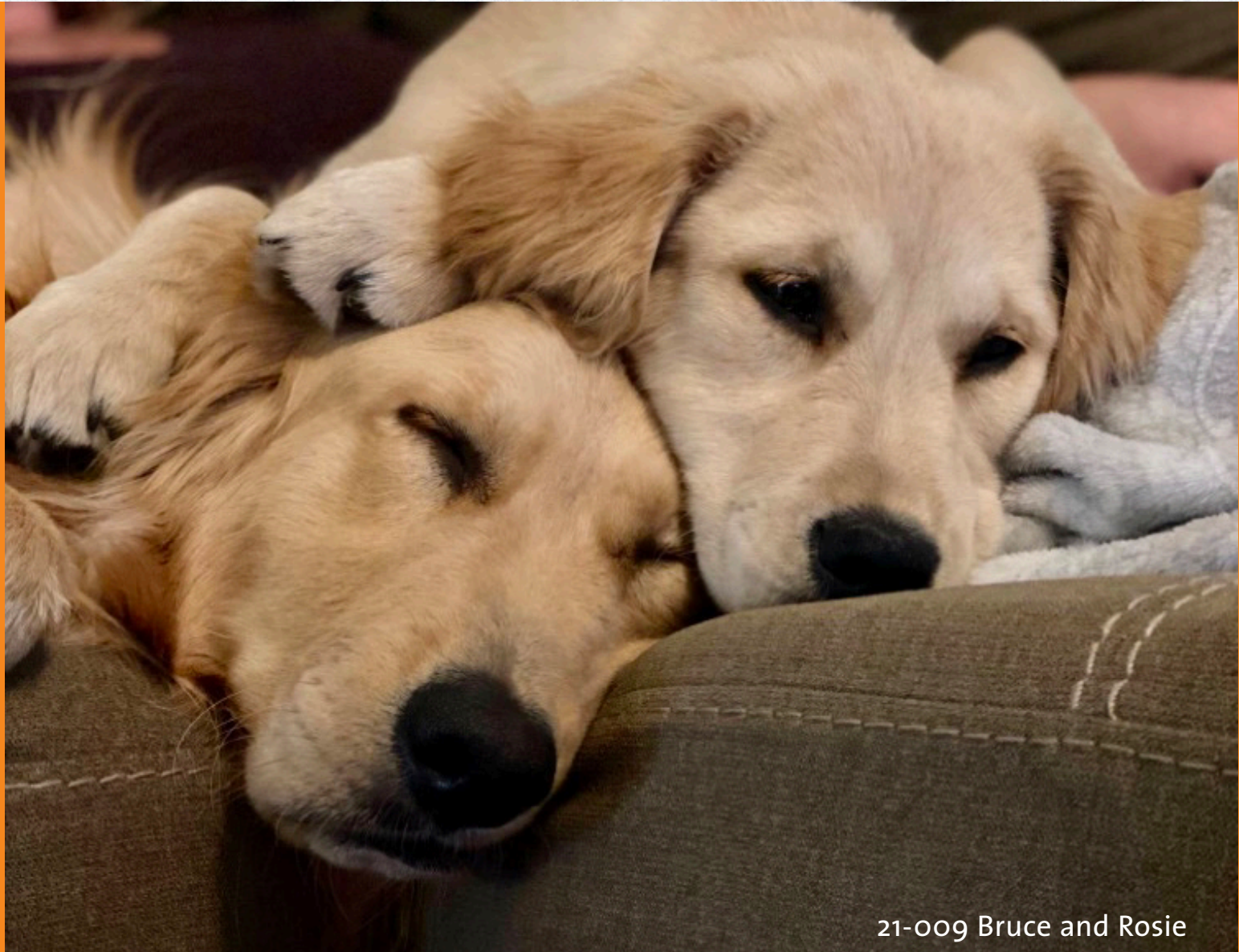
21-009 Bruce and Rosie

“Home is where the dog runs to greet you.”