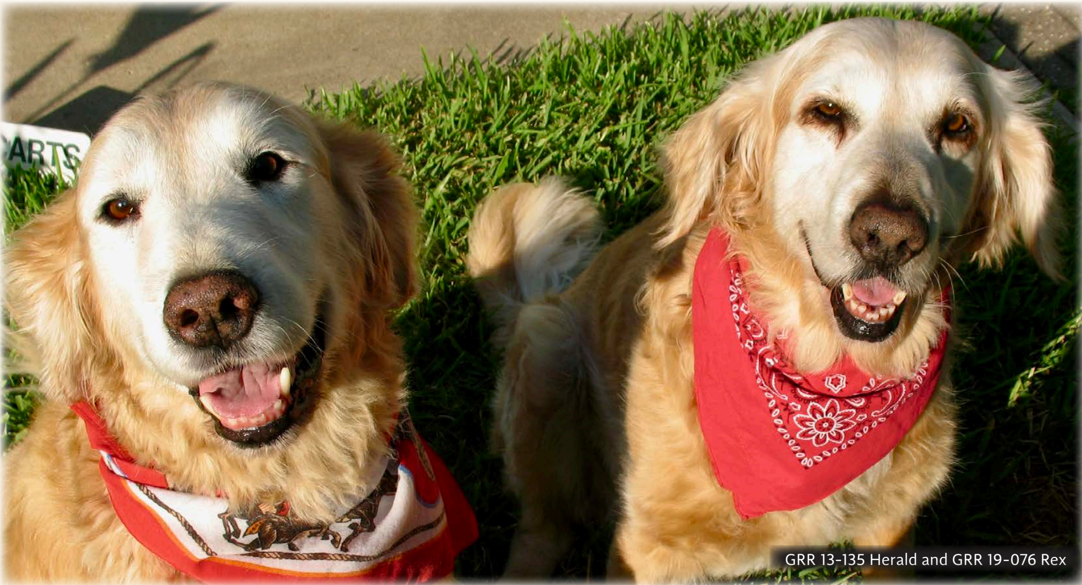
GRR 13-135 Herald and GRR 19-076 Rex

“BE THE PERSON YOUR DOG THINKS YOU ARE.”