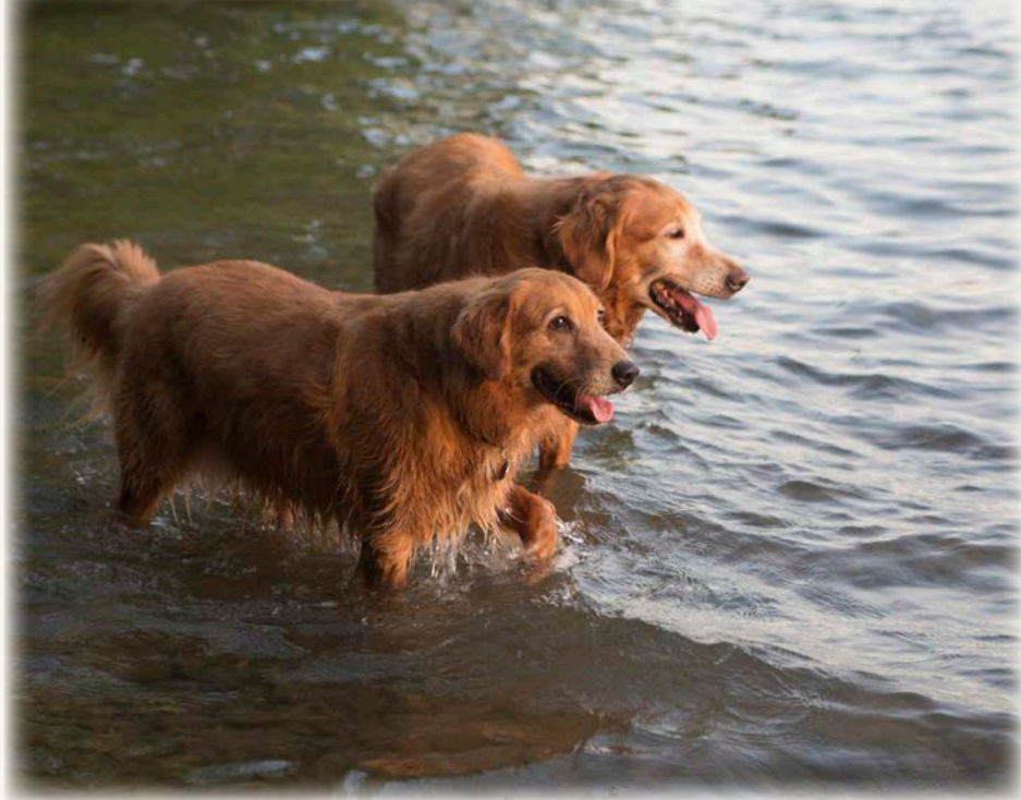
GRR 11-024 Buddy and GRR 15-019 Finn