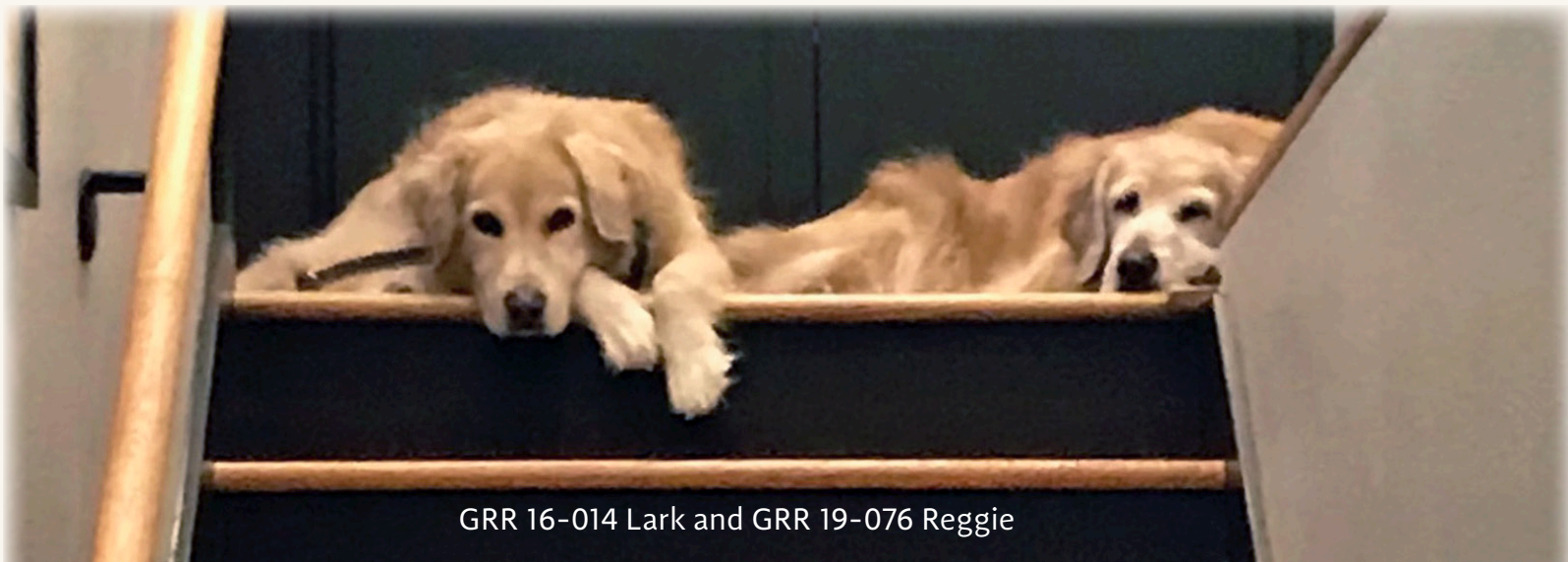
GRR 16-014 Lark and GRR 19-076 Reggie

Please note that before leaving Turkey, all dogs receive medical exams, are microchipped and get health certificates which are reviewed by the USDA upon entry to the United States. The dogs have also spent 30 days in quarantine in Turkey before entering the US. The dogs are then further vetted by a preferred veterinarian in Austin. Because our international programs have been successful, we plan to bring more international dogs to Texas in 2021.