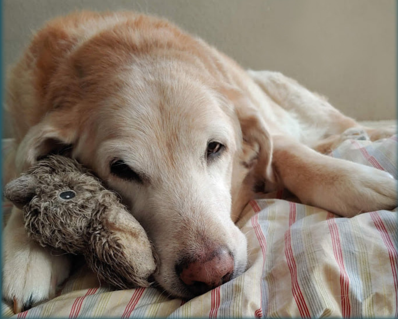
GRR 17-020 Bevo