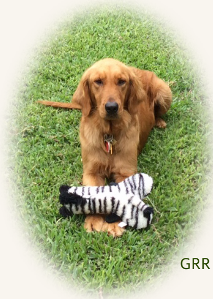
GRR 20-027 Layla