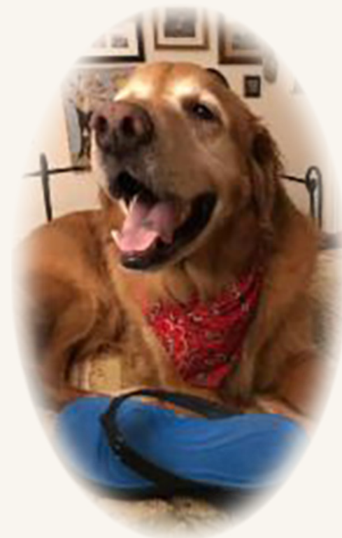
GRR 20-036 Charlie